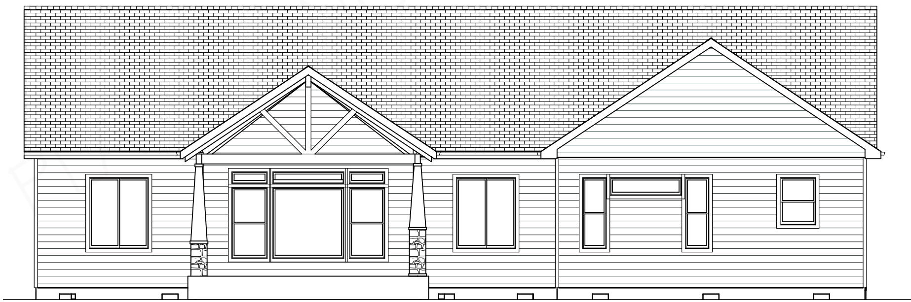
REAR ELEVATION 1/8 in = 1 ft